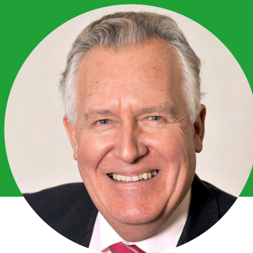
Lord Hain (Peter Hain) Non-Executive Director

His strong track record of founding and leading companies in these sectors, and the experience gained, gives him a balanced view of the opportunities and challenges at hand. His knowledge of the gas industry, coupled with a drive to make a meaningful change in South Africa, is of significant benefit to DNG Energy and its partners.